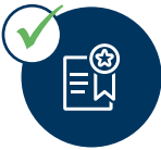
Standardized carrier codes